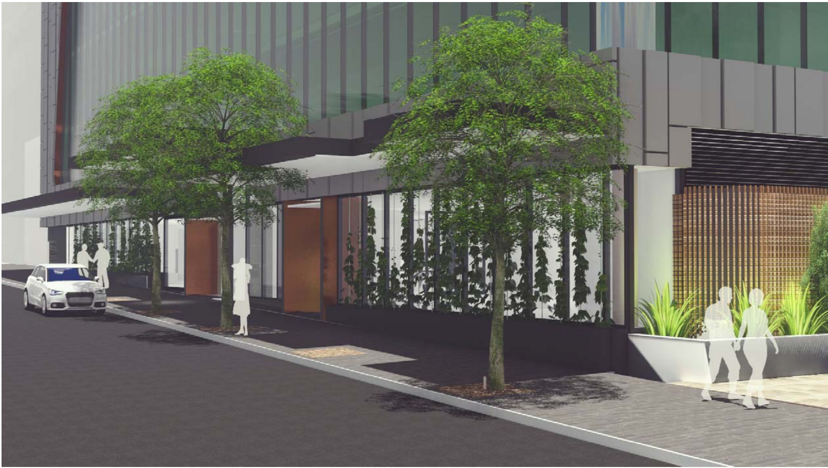
2 West Facing Perspective