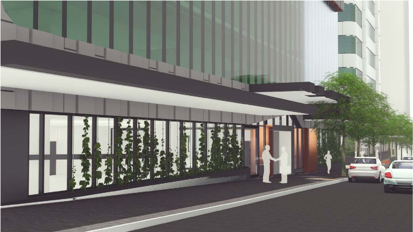
1 East Facing Perspective