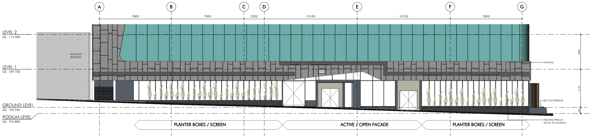
1 South Elevation - Planter Boxes Option B 1 : 100